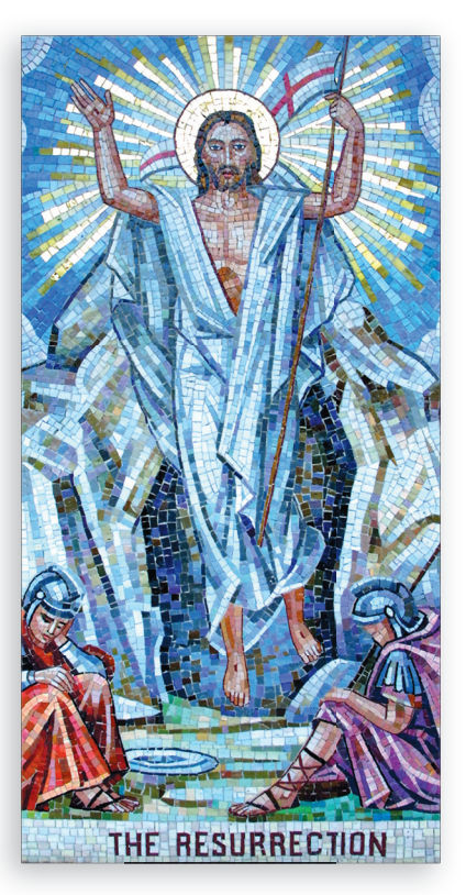
Last issue's image...