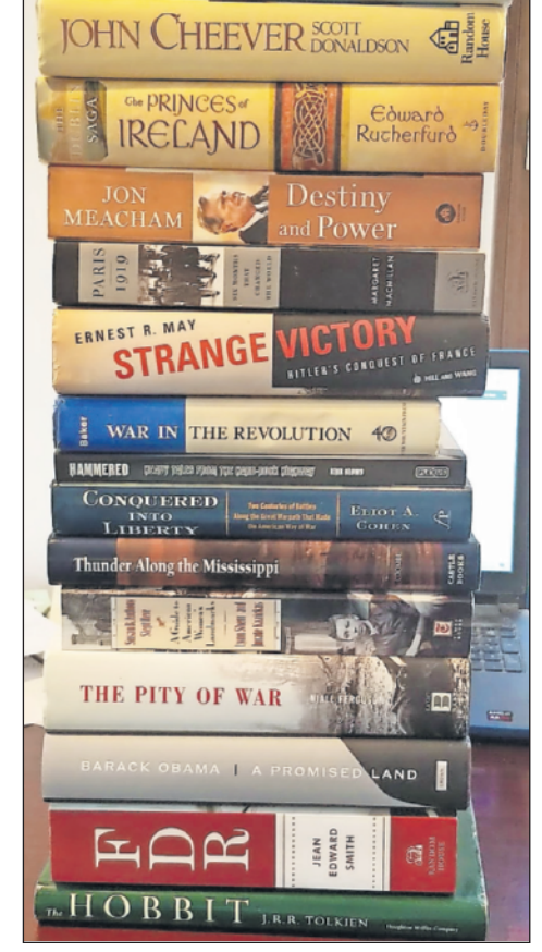
From Hollywood to horror to military history to Americana and anything in-between, every book is its own master work.

That quaint house on Central Avenue in Flemington with Victorian lamps dotting the property is actually a treasure trove for the discerning bookworm or collector.