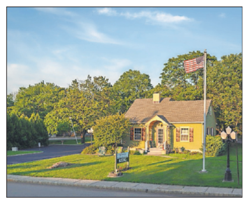
Peruse the catalogued book shelves while enjoying a free cup of coffee at Act 2 Books, located at 24 Central Station in Flemington.

Six days a week, except for Monday, you can peruse the catalogued bookshelves while enjoying a free cup of coffee at the store located at 24 Central Station from 11 a.m. to 8 p.m. on Tuesday through Saturday, with hours on Sunday from noon to 6 p.m. The vast selection is listed online at www.Act-2Books.com as well. Non-perishable food