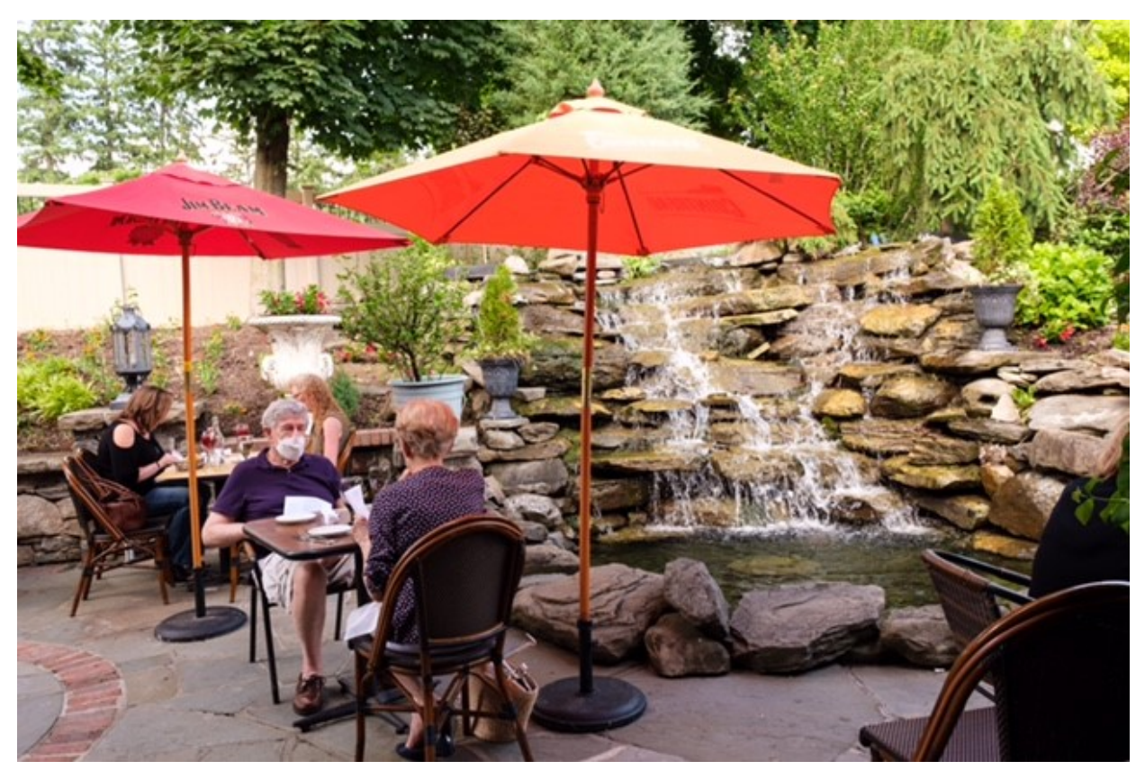
An expansive outdoor space with tables for 160 patrons is bedecked with greenery once again and reopened for dining under the protection of a shaded canopy.

"I've done my research on other Italian restaurants," Amen said. "There's a major choice in difference between us and them on menus."