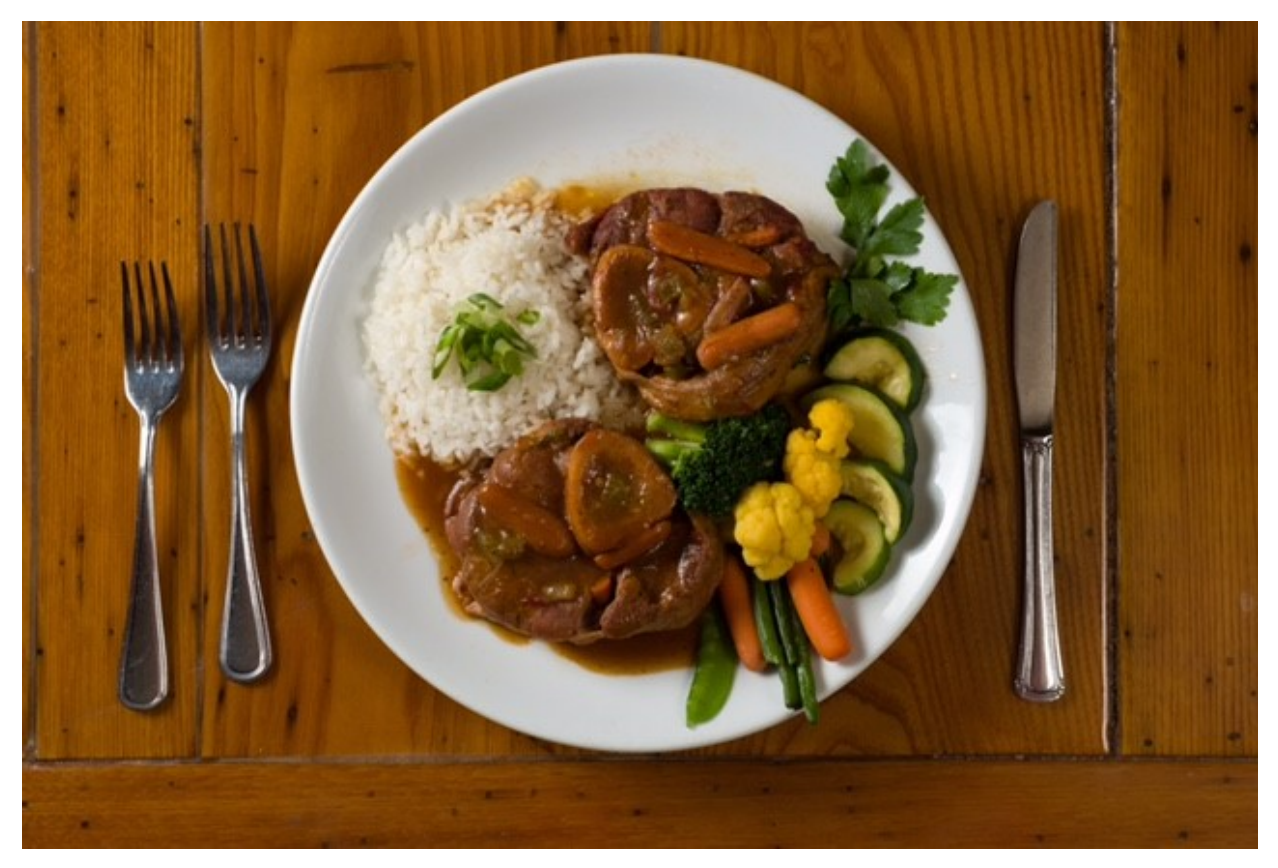
As the seasons change, so does the menu here with a diverse variety of pasta sauces as well as selections that reflect ingredients currently in season or trending in the food service industry.

The rustic, ornate restaurant interior has modern touches reminiscent of a Tuscany villa. The backdrop is a pleasant setting for private parties held on the second floor, or for lunch and dinner with family and friends on the ground floor, which can seat 400. An expansive outdoor space with tables for 160 patrons is bedecked with greenery once again and reopened for dining under the protection of a shaded canopy. For hotter days later in the summer, accommodating fans will provide a light breeze through the alfresco setting.