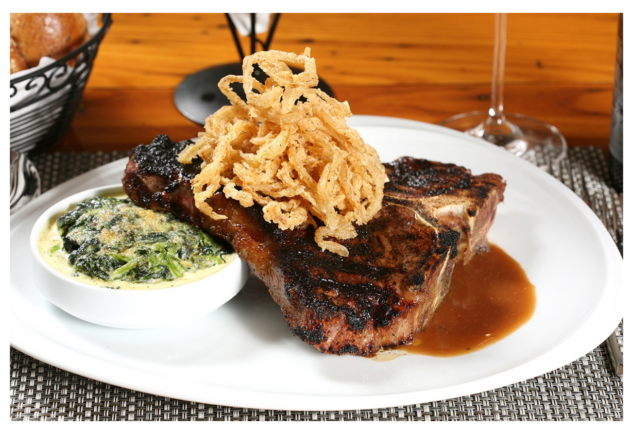
. With a traditional, yet contemporary, Italian/American menu of 60 entrees, there is a delectable dish to satisfy any customer who enjoys good food and wine in a beautiful setting either indoors or out.