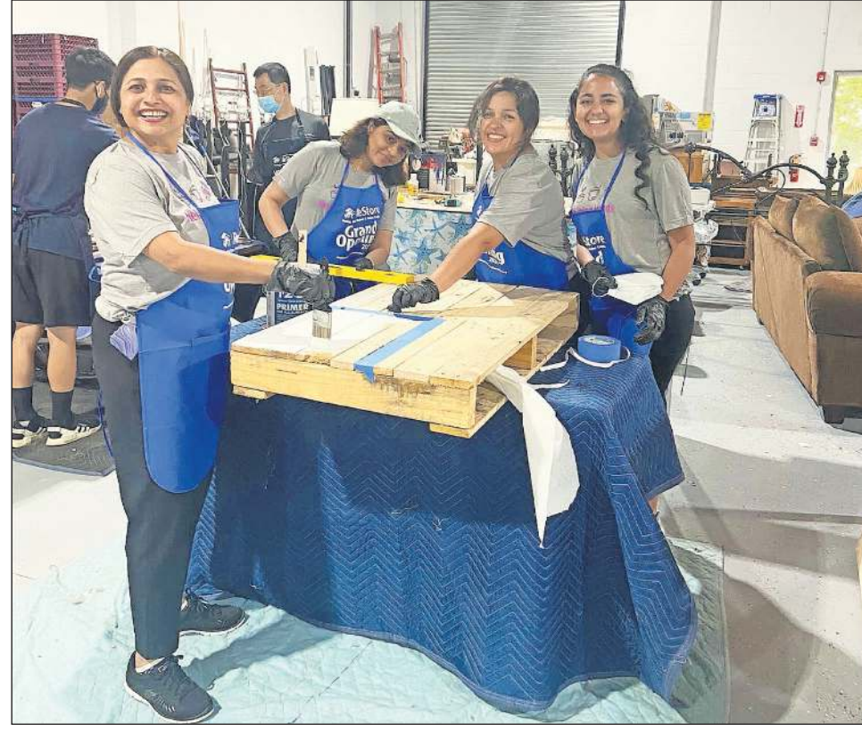
Habitat for Humanity of Greater Newark's ReStore volunteers help merchandise the items into appealing displays, clean and sanitize the donations, prep, assemble and even upcycle some pieces using the recycled RECOLOR paint.

Habitat for Humanity of Greater Newark's ReStore volunteers help merchandise the items into appealing displays, clean and sanitize the donations, prep, assemble and even upcycle some pieces using the recycled RECOLOR paint sold in the store. Eventually, Car-