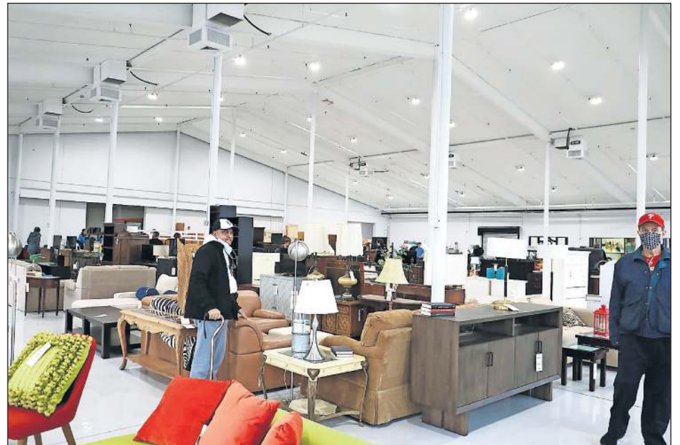
Habitat for Humanity of Greater Newark's ReStore inventory of items differs from thrift shops by focusing on gently used donated household home improvement needs from furniture to tiles to hardware.