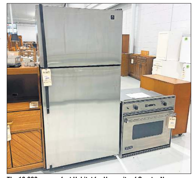
The 18,000-square-foot Habitat for Humanity of Greater Newark's ReStore houses only items that are in excellent condition for do-it-yourself homeowner projects.

vajal plans to also introduce craft workshops led by experienced volunteers.