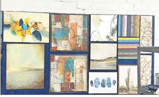
Union counties for Greater Newark Habitat for Humanity. Art that once brightened the corridors and walls of homes throughout the area can find new life at Habitat for Humanity of Greater Newark's Restore.

itat for Humanity of Greater Newark's ReStore inventory of items differs from thrift shops by focusing on gently used donated household home improvement needs from furniture to tiles to hardware. There also are décor, appliances, cabinetry and light fixtures that once inhabited a home but found their way to this large self-service warehouse to occupy yet another abode — maybe yours. The great advantage